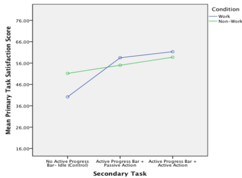
Figure 3: Graphical representation of the interaction between task and Active Progress Bar condition.

Progress Bar conditions had a positive impact on satisfaction in the Work condition when comparing it to the control condition.