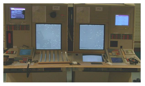
Figure 1: ODS control position

This control position is clearly designed for two controllers with specific activities and roles. The tactic controller (on the left), is in charge of contacting aircrafts, attributing clearances, managing guidance and separations, resolving conflicts and transferring aircrafts to other sectors. His/her main tools are the paper strip board, the radar display and the radio. The planner controller (on the right) is in charge of inter-sector coordinations, integration of new strips and pre-analysis to help the tactic controller. His/her tools are the strip board, the telephone and the radar display.