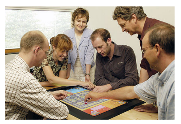
Figure 2: Philips Entertaible

Recent technological advances in user input tracking have enabled the construction of interactive tables that can now be commercialized. They enable the detection and tracking of multiple points of input, including complex shapes such as hand profiles, from multiple users simultaneously.